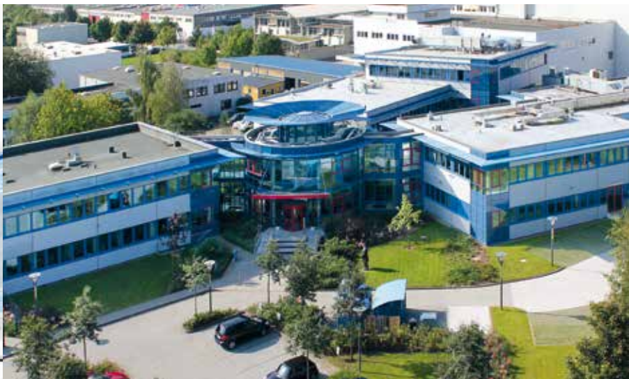
The Technology Centre in Ahrensburg near Hamburg